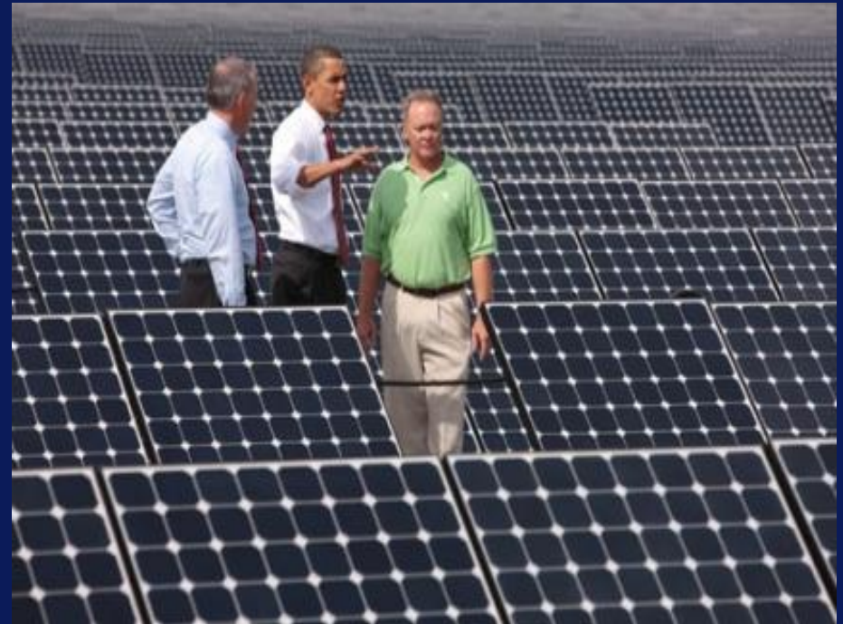
President Obama, October 27, 2009, at the DeSoto Next Generation Solar Energy Center, Announcing the Smart Grid Investment Grant Awards